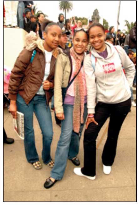
At AIRRC, the color of immigration is BLACK! by Larry Saxxon